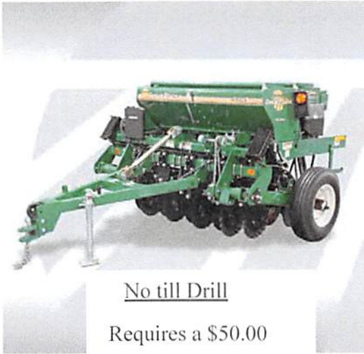
No till Drill