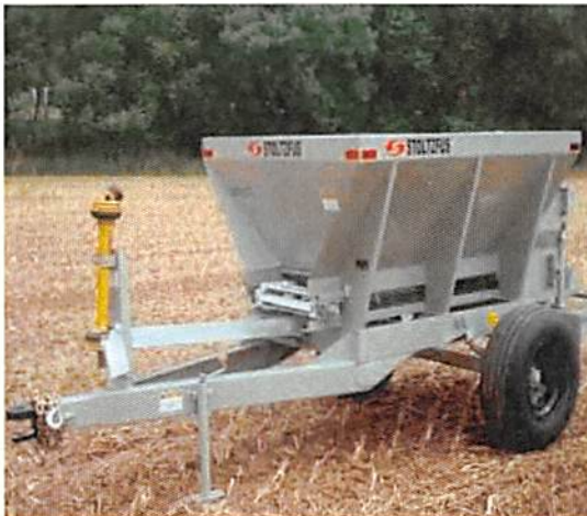
2 Ton Lime Spreader