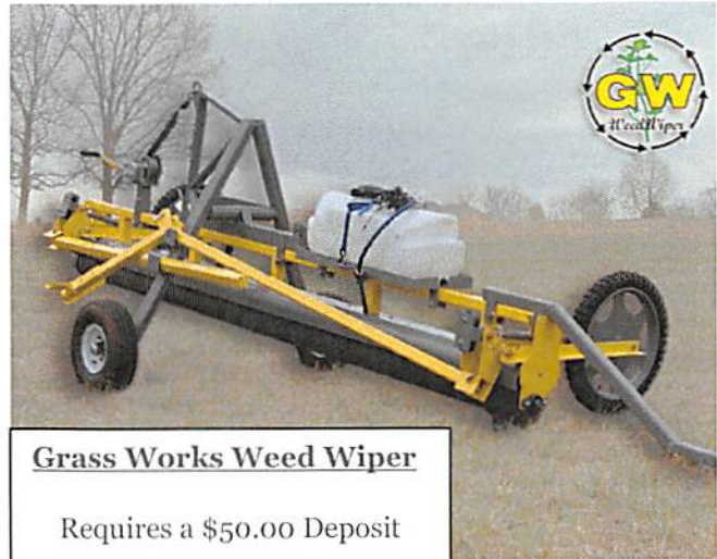
Grass Works Weed Wiper

Requires a $50.00 Deposit $50.00 a day (Unit can be pulled with a tractor or ATV)