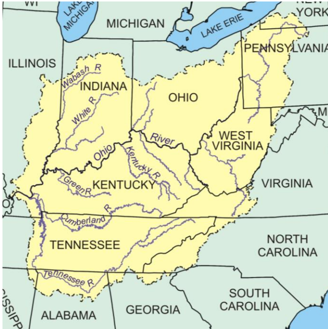
Ohio River Watershed