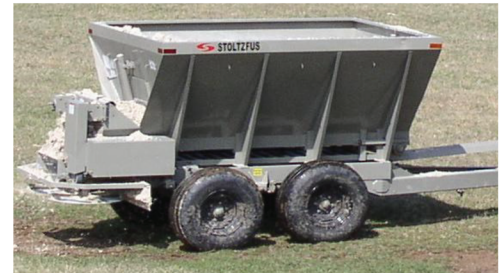
Stoltzfus 5 Ton Lime Spreader