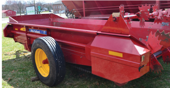
New Holland 165