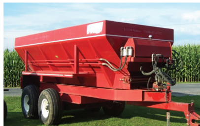
BBI Poultry Litter Spreader