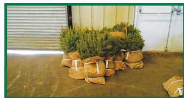
This is how evergreens come from the nursery

A little bit of the process on how your order is created on a typical year: