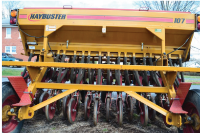
Haybuster Model 107