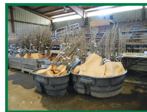
Fruit trees that came from the nursery. Special paper was placed on top to protect roots.