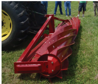
I & J Roller Crimper