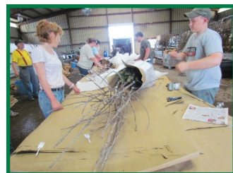
"Wrappers" packaging the orders