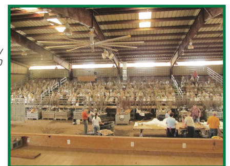
Berkeley County orders ready for pickup