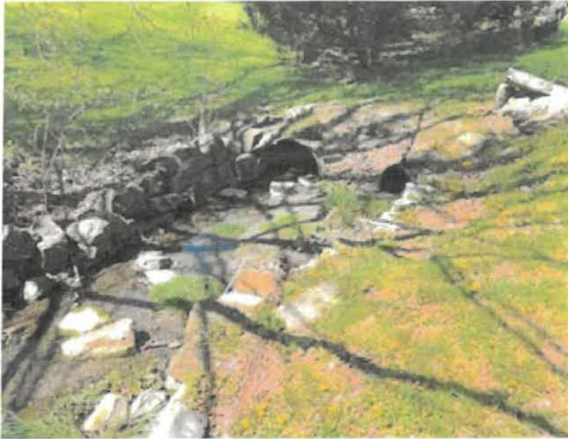
Beginning of Lewis Spring Creek on Montwell Commons. Flow emerges from culvert, having passed under U.S. 219. Second, smaller culvert carries storm water runoff.