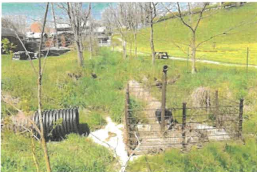
Looking upstream from the sink-hole.