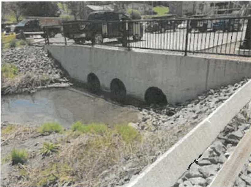
Beginning of the lower stream section. Water flow emerging from culverts.