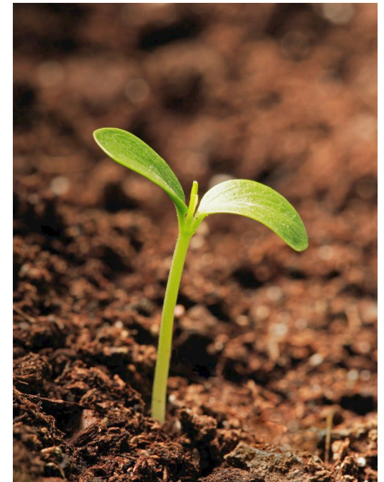
Up Close Conservation

Questions? Email jnandi@wvca.us or call 304-253-0261