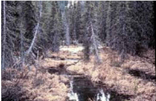
Figure 11. Drainage pattern

adjacent to streams, consists of surface evidence of drainage flow into or through an area (Figure 11). In some wetlands, this evidence may exist as a drainage pattern eroded into the soil, vegetative matter (debris) piled against thick vegetation or woody stems oriented perpendicular to the direction of water flow, or the absence of leaf litter (Figure 8). Scouring is often evident around roots of persistent vegetation. Debris may be deposited in or along the drainage pattern (Figure 12).