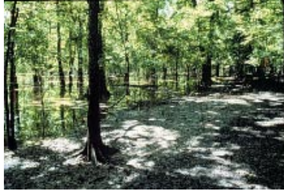
Figure 8. Absence of leaf litter

sources of water flow in wetlands, but also often occurs in tidal marshes. Evidence consists of deposition of debris in a line on the surface (Figure 8) or debris entangled in aboveground vegetation or other fixed objects. Debris usually consists of remnants of vegetation (branches, stems, and leaves), sediment, litter, and other waterborne materials deposited parallel to the direction of water flow. Drift lines provide an indication of the minimum portion of the area inundated during a flooding event; the maximum level of inundation is generally at a higher elevation than that indicated by a drift line.