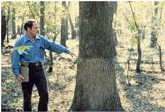
Figure 7. Watermark on trees

For soil saturation to impact vegetation, it must occur within a major portion of the root zone (usually within 12 inches of the surface) of the prevalent vegetation. The major portion of the root zone is that portion of the soil profile in which more than one half of the plant roots occur. CAUTION: In some heavy clay soils, water may not rapidly accumulate in the hole even when the soil is saturated. If water is observed at the bottom of the hole but has not filled to the 12-inch depth, examine the sides of the hole and determine the shallowest depth at which water is entering the hole. When applying this indicator, both the season of the year and preceding weather conditions must be considered.