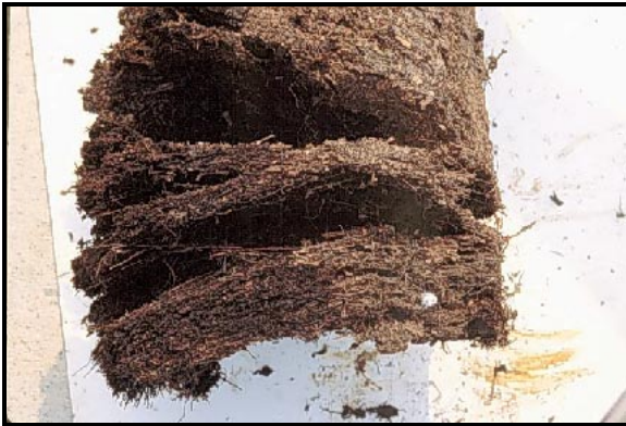
Figure 3. Organic soil

44. Several indicators are available for determining whether a given soil meets the definition and criteria for hydric soils. Any one of the following indicates that hydric soils are present: 1