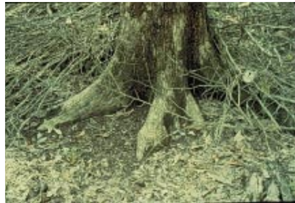
Figure 9. Sediment deposit on plants