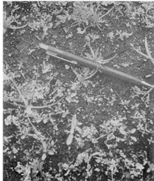
Figure 10. Encrusted detritus