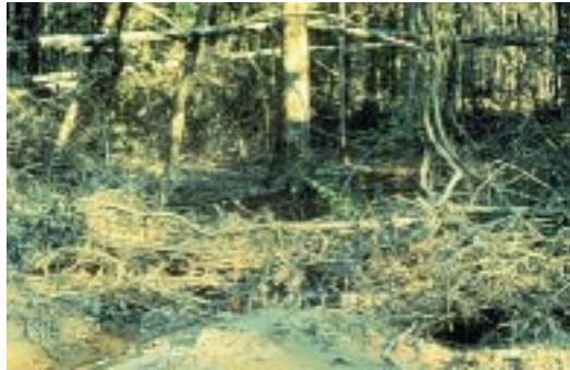
Figure 12. Debris deposited in stream channel

CAUTION: Drainage patterns also occur in upland areas after periods of considerable precipitation; therefore, topographic position must also be considered when applying this indicator.