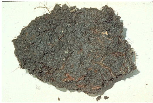
Figure 5. Soil showing matrix (brown) and mottles (reddish-brown)

state to the reduced (ferrous) state, which results in the bluish, greenish, or grayish colors associated with the gleying effect (Figure 4). Gleying immediately below the A-horizon or 10 inches (whichever is shallower) is an indication of a markedly reduced soil, and gleyed soils are hydric soils. Gleyed soil conditions can be determined by using the gley page of the Munsell Color Book (Munsell Color 1975).