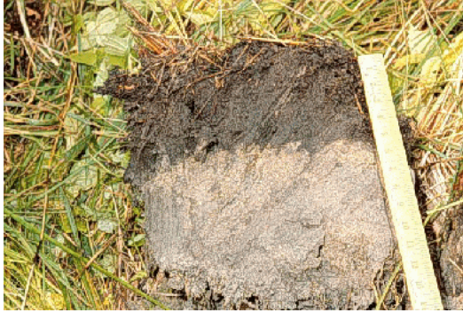
Figure 4. Gleyed soil