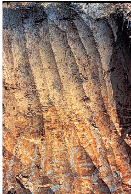
Figure 6. Iron and manganese concretions